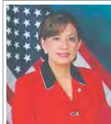
In Colo. Springs Special guest speaker Hon. Rosario Marin, 41st U.S. Treasurer