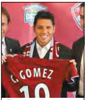
Deportes Page 9