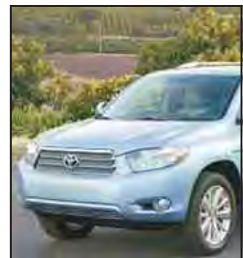
Toyota Highlander Page 12