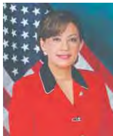
Special guest speaker Hon. Rosario Marin, 41st U.S. Treasurer

19th Annual Gala, Saturday Night 6:00 p.m. to Midnight, March 1st 2008 at the Double Tree Hotel World Arena. Everybody is invited to come join us for a mariachi reception, and a night of Dinner and Dance with our distinguished guests. Ticket price is $100.