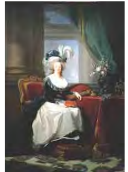
Mary Louise Elisabeth Vigee- Lebrun, Portrait of Marie Antoinette, Queen of France, ca. 1788, oil on canvas