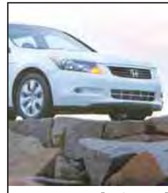
2008 Honda Accord Page 12