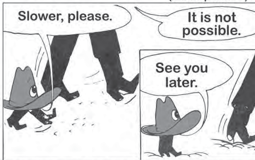
(Más despacio, por favor.)