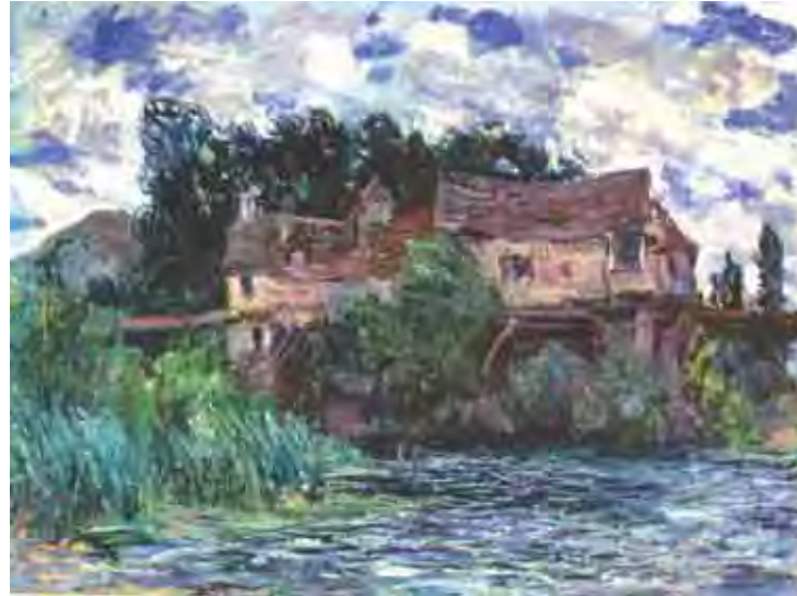
Claude Monet, House on the Old Bridge at Vernon, c. 1884, New Orleans Museum of Art

Impressionist and Modern Masters From the New Orleans Museum of Art