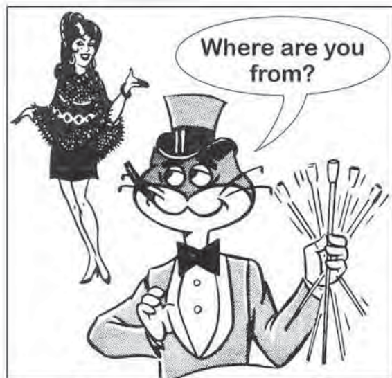
(¿De dónde es usted?)