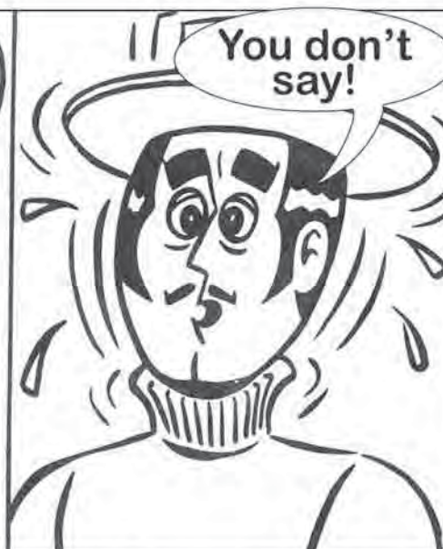
(¡No me diga!)