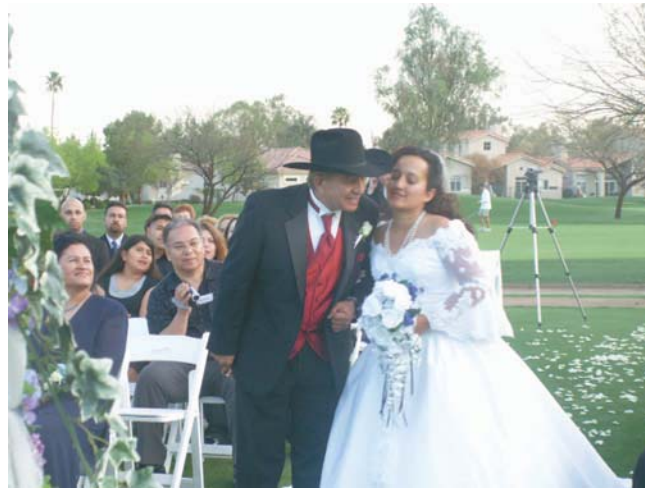
After two days of rain, it was perfect weather for a wedding