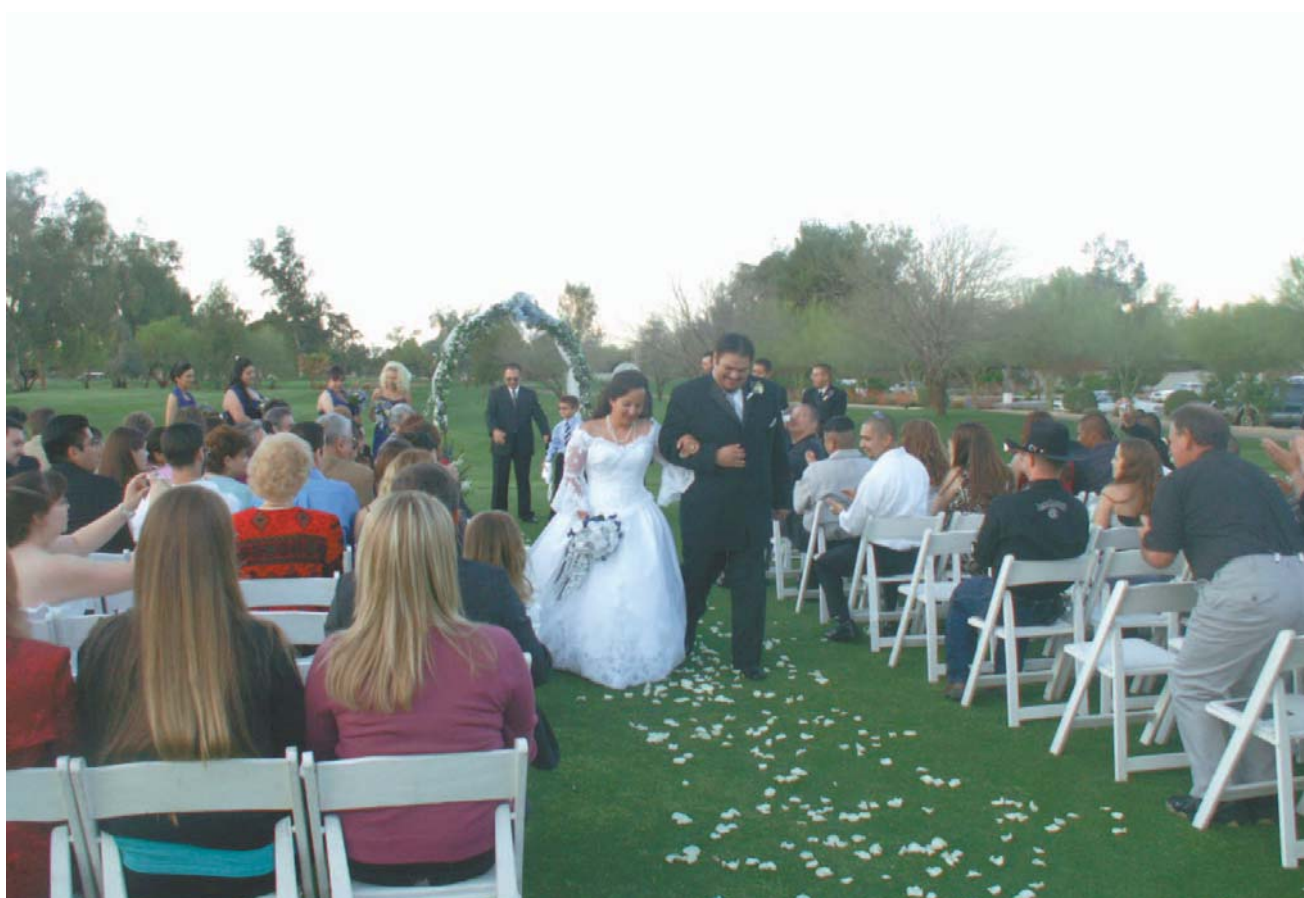
The ceremony was done; the couple, now man and wife leave the serene setting, to celebrate the start of their life together.