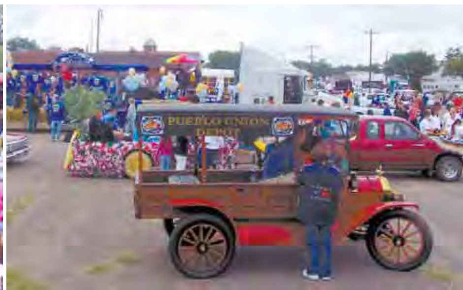
Floats line up for the Fiesta Day Parade last Sunday morning.