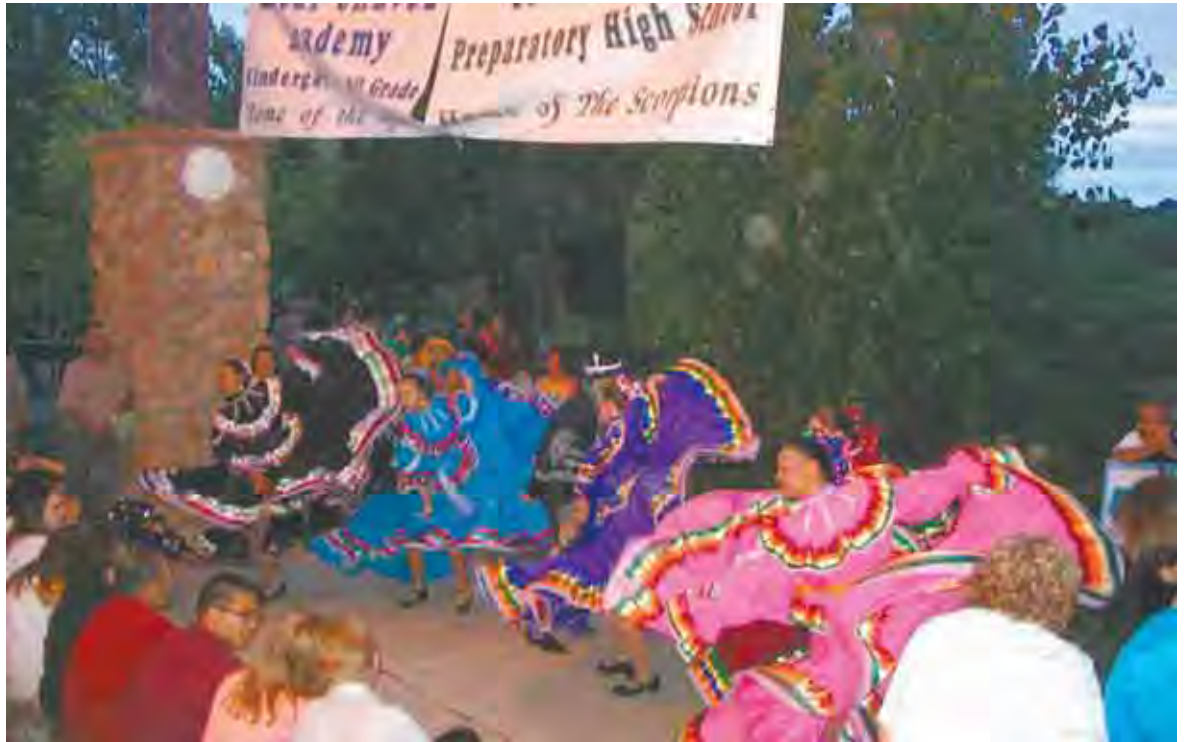
Grupo Folklorico del Pueblo dancers entertaining the crowd at the Riverwalk Boettcher Education Center

and staff members at the Historic Arkansas Riverwalk of Pueblo Boettcher Education Center. The attendees of the outdoor festivity enjoyed refreshments, the dancing of Grupo Folklorico del Pueblo, and music of Mariachi Aguila de Cesar Chavez. The Mariachis recently competed in Albuquerque, New Mexico during the Mariachi Spectacular this summer and placed 2nd at the competition.