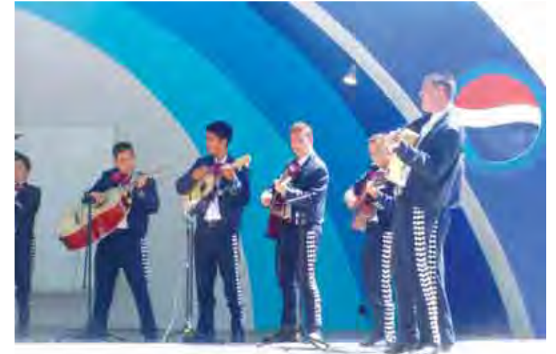
Mariachi ArcoIris showcases the talents of D60 students.