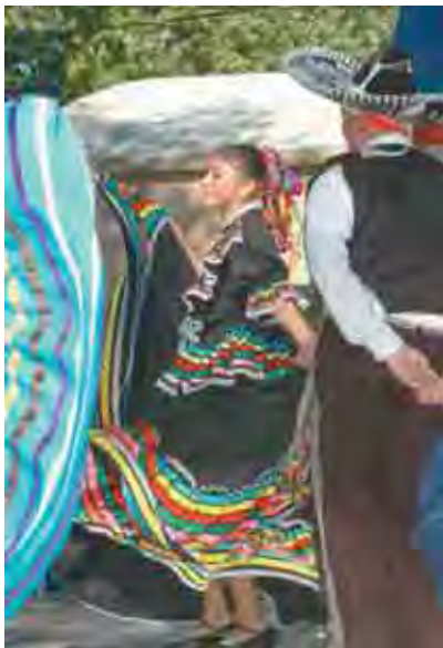
A record-breaking 72,673 attendees enjoyed the Fiesta Day celebration in Pueblo