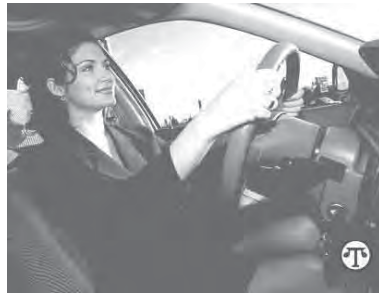
Safe driving practices may help you save money on your auto insurance because insurance companies base premiums, in part, on driving records.

Whether you're 16 or 60, responsible driving should be everyone's priority.